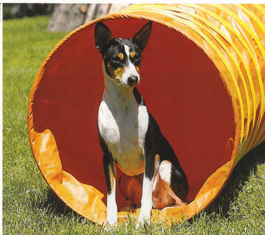
Basenjis excel at mentally and physically challenging activities, including agility.

quality — just the opposite. The top lure-coursing Basenji for the past few years, and the top show Basenji (in fact, the top Hound in 1997), have something in common: both wear the brindle badge of recent African ancestry.