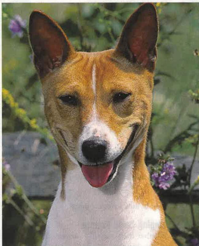
Two signature qualities of this distinctive sighthound are its devious smile, and yodelling "baroo" vocalization.