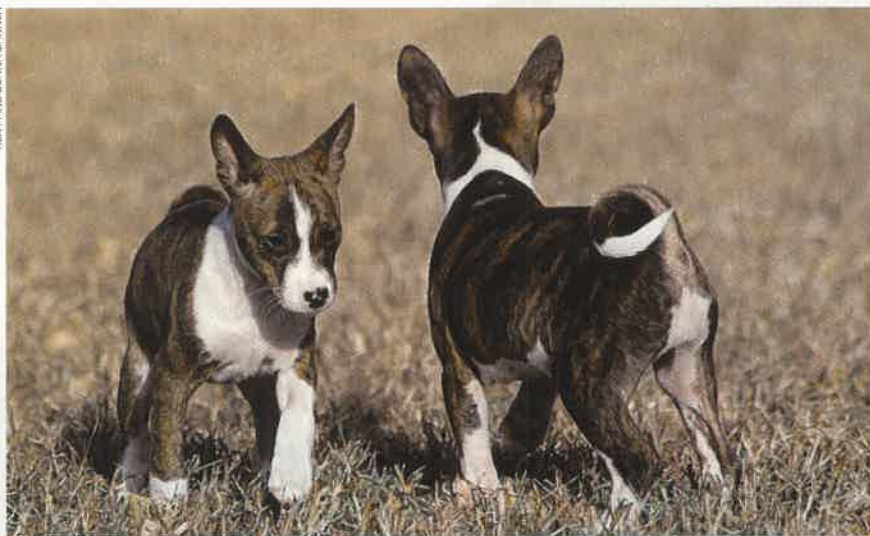
Champions in the breed today, including the reigning lure-coursing Basenji and the AKC's top Hound in 1997, wear the brindle badge of recent African ancestry.