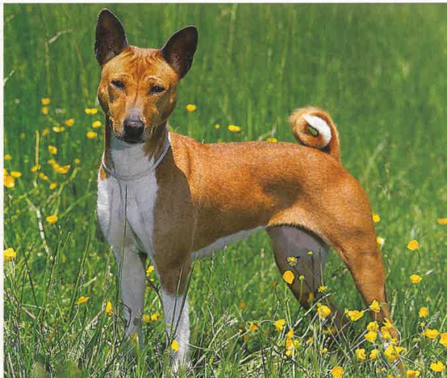
Recent DNA evidence identifies the Basenji as one of the earliest domesticated dog breeds, worldwide.